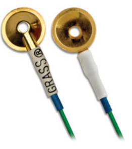
Pure, solid silver cast cup, burnished for a smooth finish